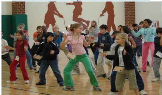
Photo below of former grantee NC Arts in Action